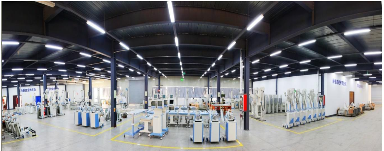
▲ Production Workshop