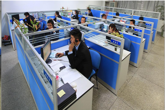
▲ One Corner of Sales Dep