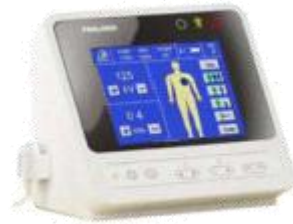
Touchable LCD Screen